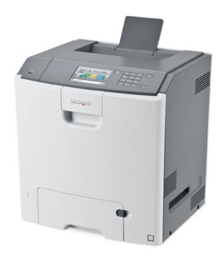
Up to 35 ppm